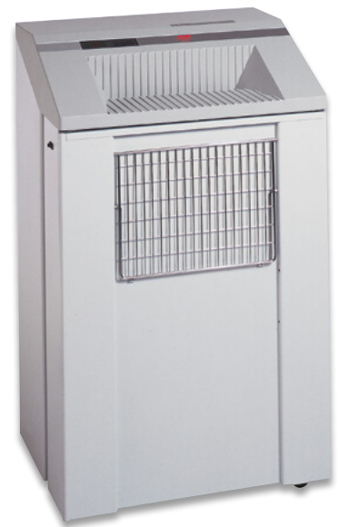
W/D/H 70 x 55 x 112 cm