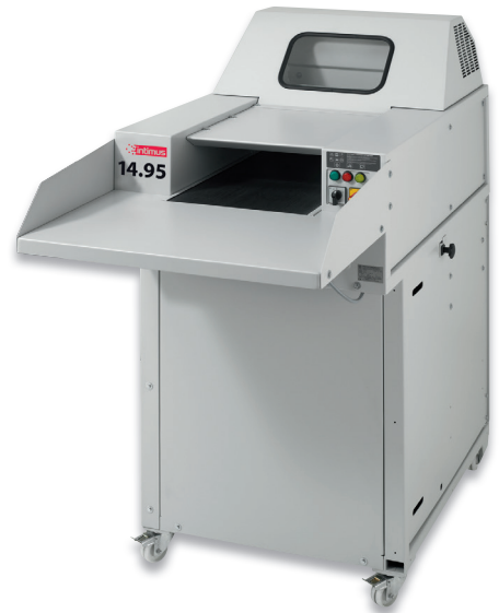
W/D/H 80/120 x 168 x 164 cm