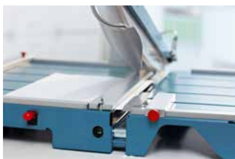
Front table with magnetic connector for more working space

For yderligere oplysninger besøg www.dahle.dk / www.cabi.dk eller ring 30506210