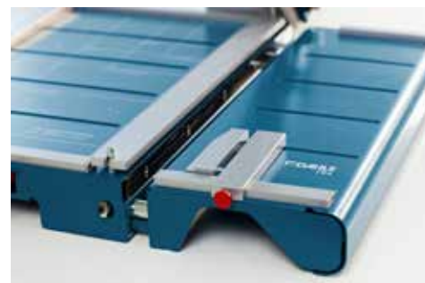
Precision narrow-strip cutting device for cutting extremely thin strips