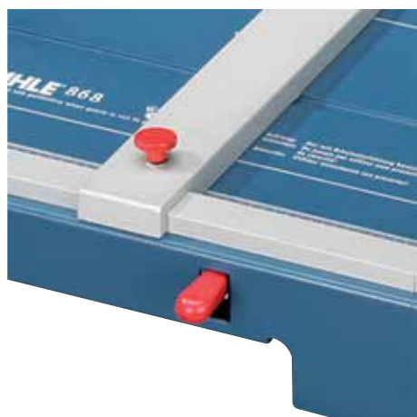
Automatic, de-selectable clamping makes easy work of cutting pressure-sensitive materials