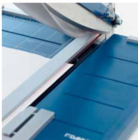
Precision laser beam line indication provides professional cutting results