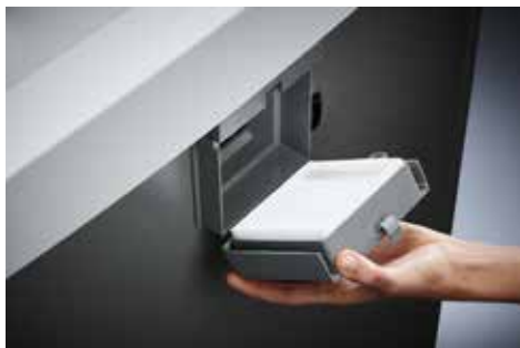
Dahle Top Secret 706air document shredder