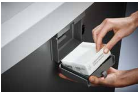
Dahle Top Secret 706air document shredder