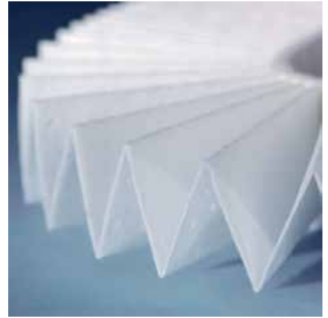
Environmentally friendly filter is made of special 3-ply, fully recyclable non-woven material