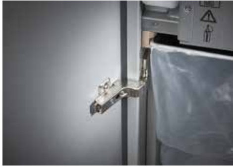
Dahle Top Secret 616air document shredder