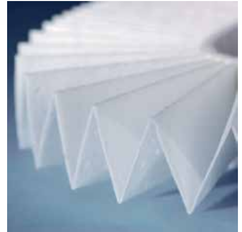
Environmentally friendly filter is made of special 3-ply, fully recyclable non-woven material