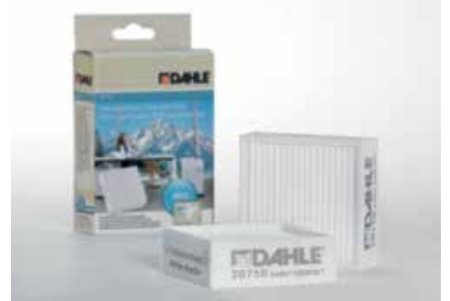
Fine particle filters Dahle 20710