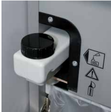
Integrated oil tank for controlled, automatic lubrication of the cross-cut cutters helps to lengthen service life while keeping performance constant