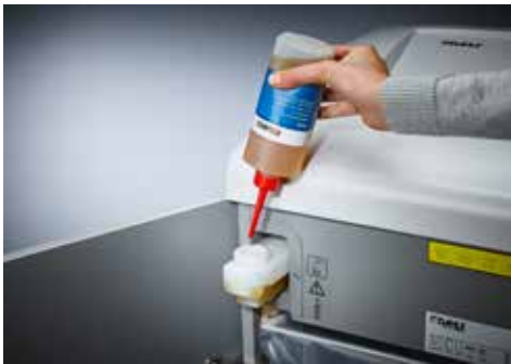
Dahle Top Secret 616air document shredder