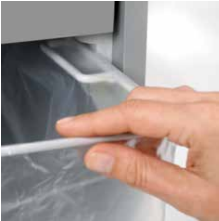
Pull-out rounded top frame that's kind on the fingers when changing the waste bag