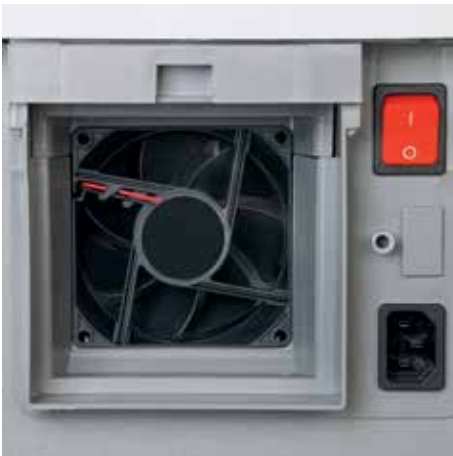
Powerful fan sucks in fine dust particles inside the document shredder and feeds them to the filter