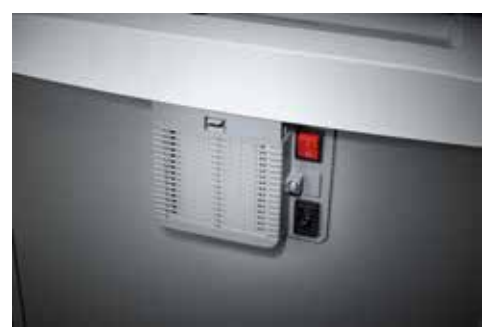
Dahle Top Secret 616air document shredder