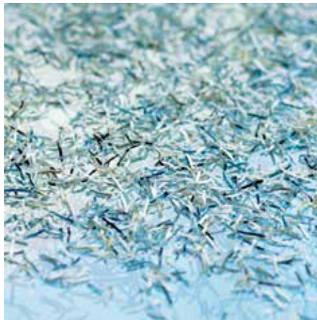
P-6 security: recommended for data media containing secret data demanding exceptionally stringent security measures

For yderligere oplysninger besøg www.dahle.dk / www.cabi.dk eller ring 30506210