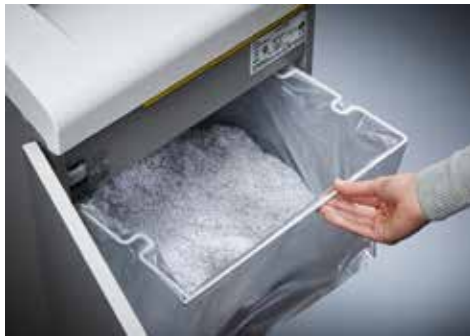
Dahle Top Secret 616air document shredder