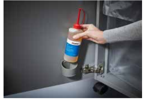
Dahle Top Secret 616air document shredder