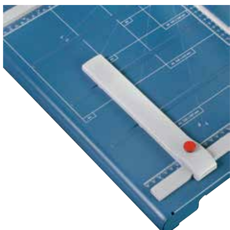
Adjustable backstop for quickly finding the right format can be used on both scale bars

For yderligere oplysninger besøg www.dahle.dk / www.cabi.dk eller ring 30506210