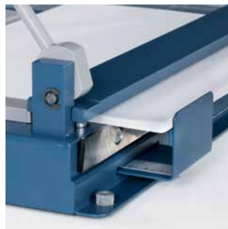
Powerful performance from Dahle model 564 for cutting up to 50 sheets