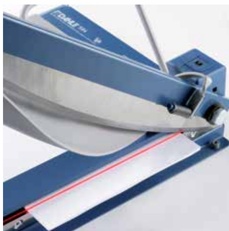
Precision laser beam line indication provides professional cutting results