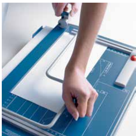
Manual D-bar clamp for holding item being cut perfectly in place