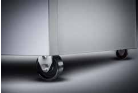
Dahle Security 519 document shredder