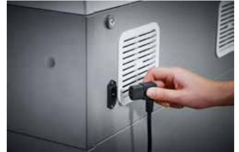
Dahle Security 519 document shredder