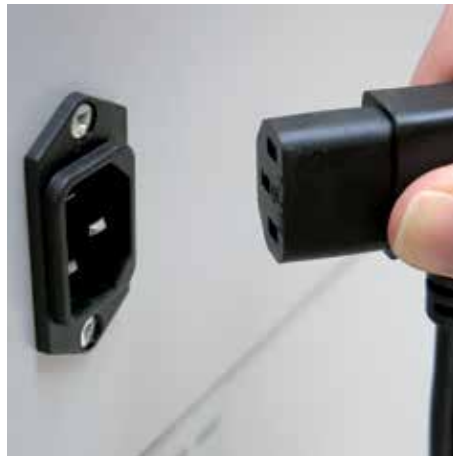
Detachable IEC power plug makes the document shredder quick and easy to move from A to B