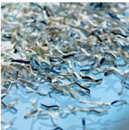
P-5 security: recommended, for example, for data media containing secret data

For yderligere oplysninger besøg www.dahle.dk / www.cabi.dk eller ring 30506210