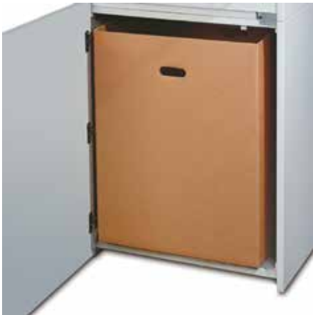
Sturdy waste boxes for permanent use with models 20390 to 20397