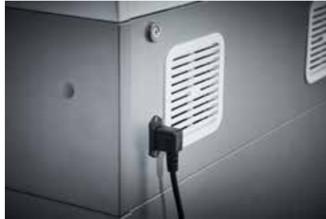
Dahle Security 519 document shredder