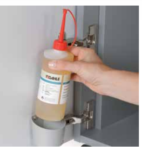
Environmentally friendly oil is always easy to access, included with all cross-cut models