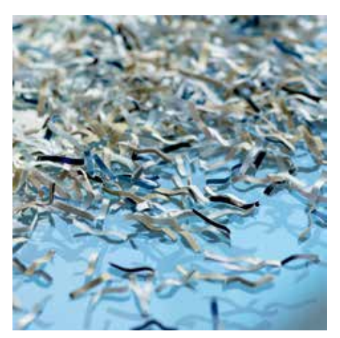
P-5 security: recommended, for example, for data media containing secret data

For yderligere oplysninger besøg www.dahle.dk / www.cabi.dk eller ring 30506210