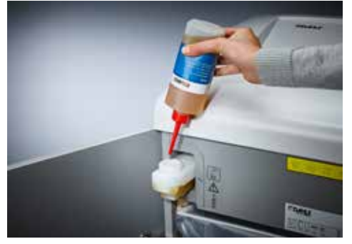
Dahle Security 510air document shredder