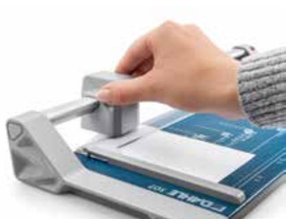
Dahle 507 rotary trimmer (3rd generation) - simple to use with two fingers thanks to improved cutting head ergonomics