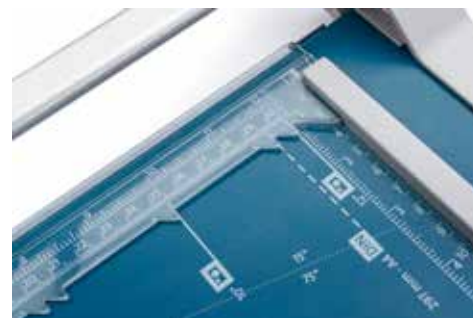
Dahle 507 rotary trimmer (3rd generation) - practical format lines and pressure clamp with markings make it easier to align the material to be cut

For yderligere oplysninger besøg www.dahle.dk / www.cabi.dk eller ring 30506210