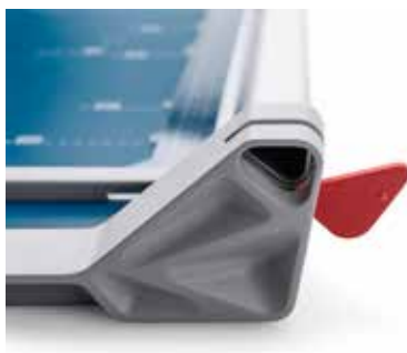
Dahle 507 rotary trimmer (3rd generation) - replace cutting heads easily with undetachable locking mechanism