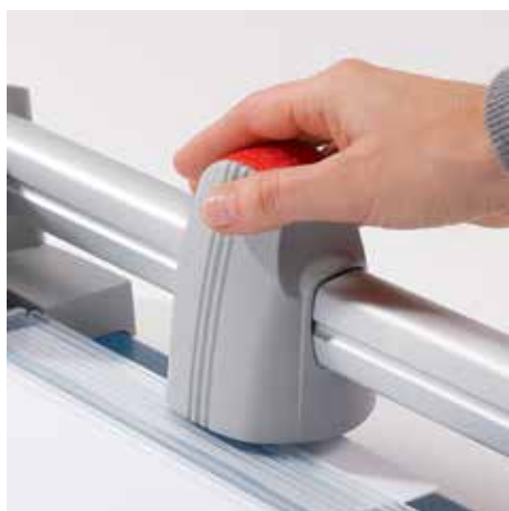
Ergonomic cutting head for convenient cutting-machine operation

For yderligere oplysninger besøg www.dahle.dk / www.cabi.dk eller ring 30506210