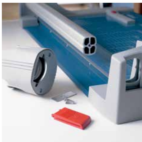
Easy-to-change cutting head to keep work processes running smoothly