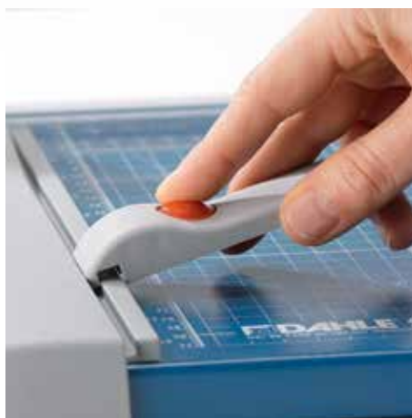
Adjustable backstop for quickly finding the right format - can be used on both scale bars