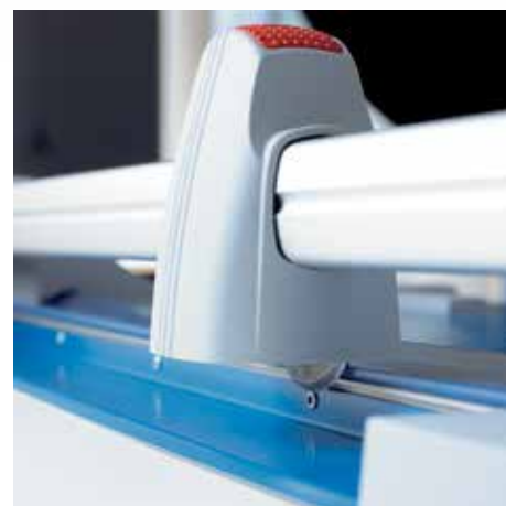
Circular blade in the sealed plastic housing provides maximum safety