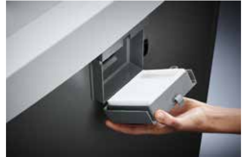
Dahle Office 410air L plus document shredder