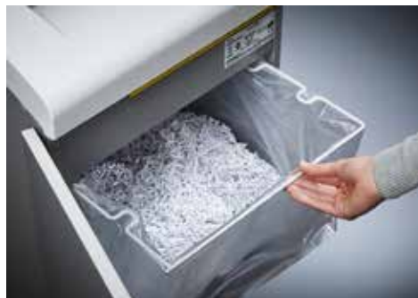
Dahle Office 410air L plus document shredder