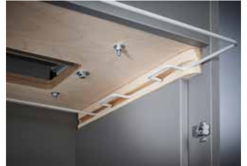
Dahle Office 410air L plus document shredder