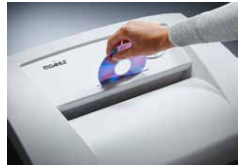
Dahle Office 410air L plus document shredder