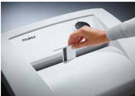
Dahle Office 410air L plus document shredder