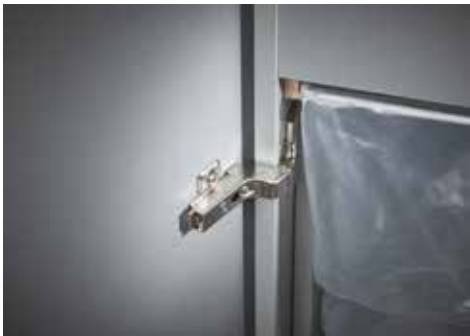
Dahle Office 410air L plus document shredder