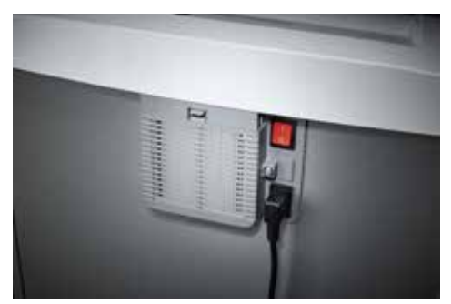
Dahle Office 410air L plus document shredder