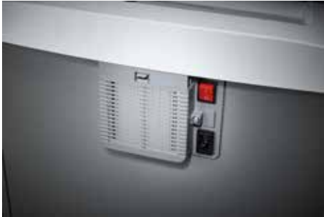
Dahle Office 410air L plus document shredder