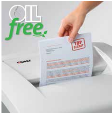
Shredding the convenient way, all without the time-consuming process of oiling the cutters