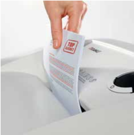
Innovative MHP technology® shreds up to 30 % more paper