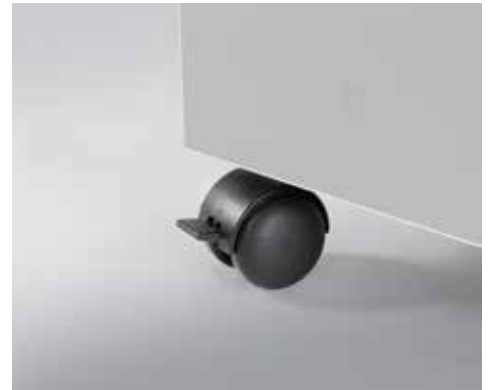
Practical swivel casters for flexible use