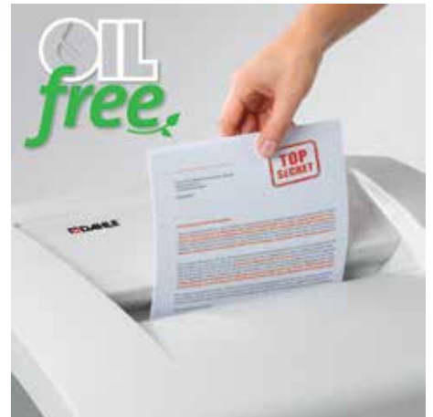
Shredding the convenient way, all without the time-consuming process of oiling the cutters