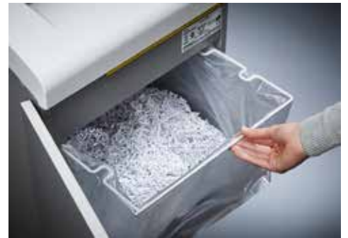
Dahle Office 404air document shredder