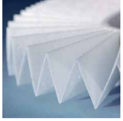
Environmentally friendly filter is made of speci- Powerful fan sucks in fine dust particles inside al 3-ply, fully recyclable non-woven material