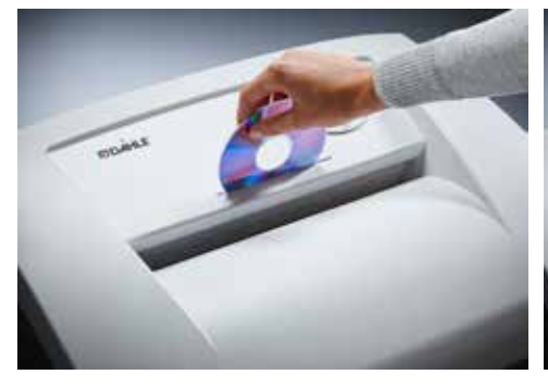
Dahle Waste 210air document shredder