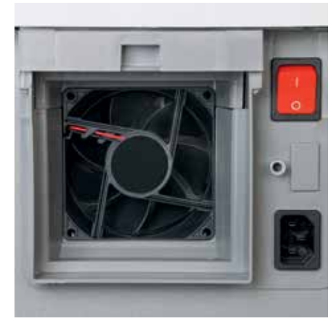
the document shredder and feeds them to the filter