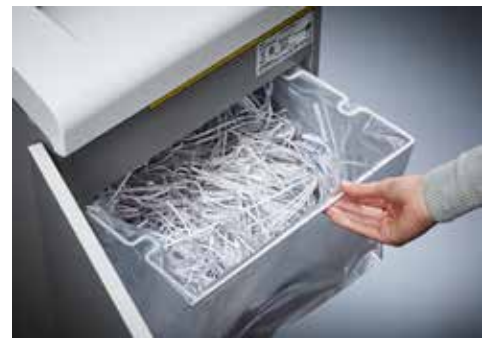
Dahle Waste 206 document shredder