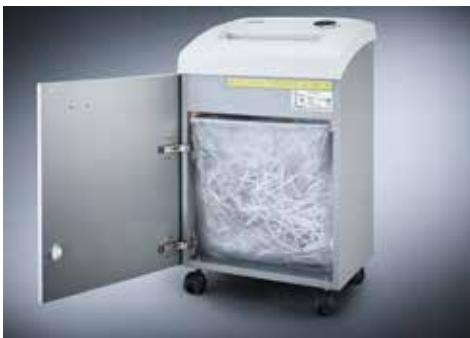
Dahle Waste 204 document shredder