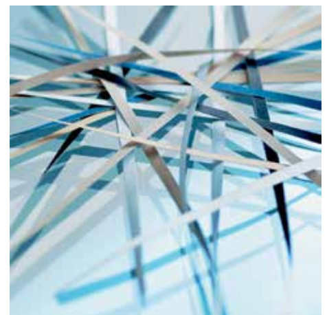
P-2 security: recommended, for example, for data media containing internal data that are to be made illegible