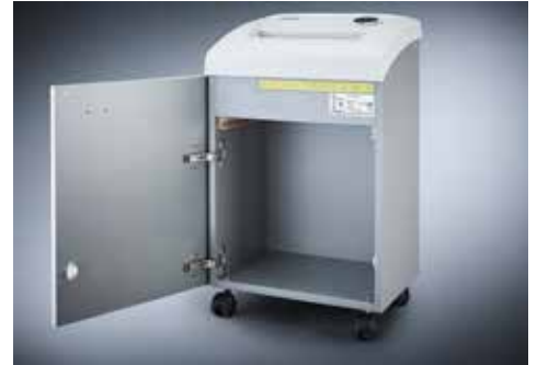
Dahle Waste 204 document shredder